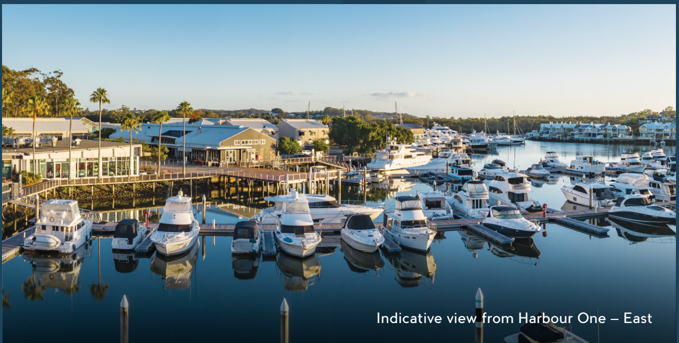
Indicative view from Harbour One – East