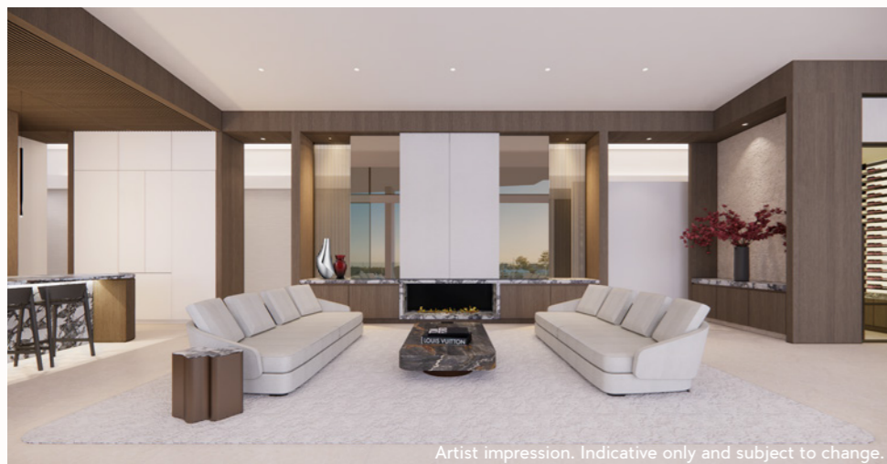
Artist impression. Indicative only and subject to change.