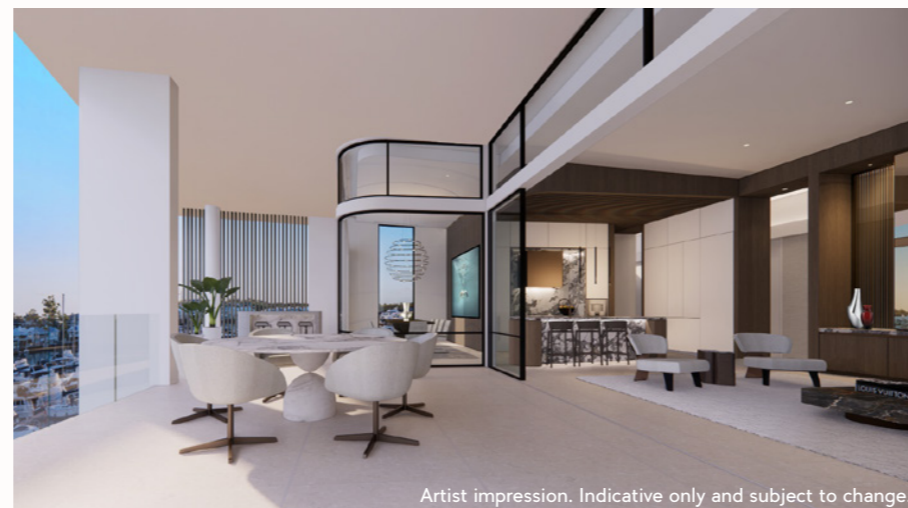
Artist impression. Indicative only and subject to change.

Disclaimer: These floor plans are provided for illustrative purposes only and are intended to give an indication of the proposed layout of lot. Changes may be made to layout of the lot (including window locations which differ on each level) during development as permitted by the Contract and all images and dimensions in these floor plans are not a representation by the seller or its agents or representatives. Whilst all reasonable care has been taken in providing this information the seller and its related companies and their representatives, consultants and agents accept no responsibility for the accuracy of any information contained herein or for any action taken in reliance thereon by any third party whether purchaser, potential purchaser or otherwise. In addition, the loose items depicted on the floor plans (including, without limitation, any tables, chairs, lounge suits, sideboards, entertainment units, outdoor furniture and beds which may be depicted) are not by virtue of this floor plan included in the lot. Version 1 : March 2023