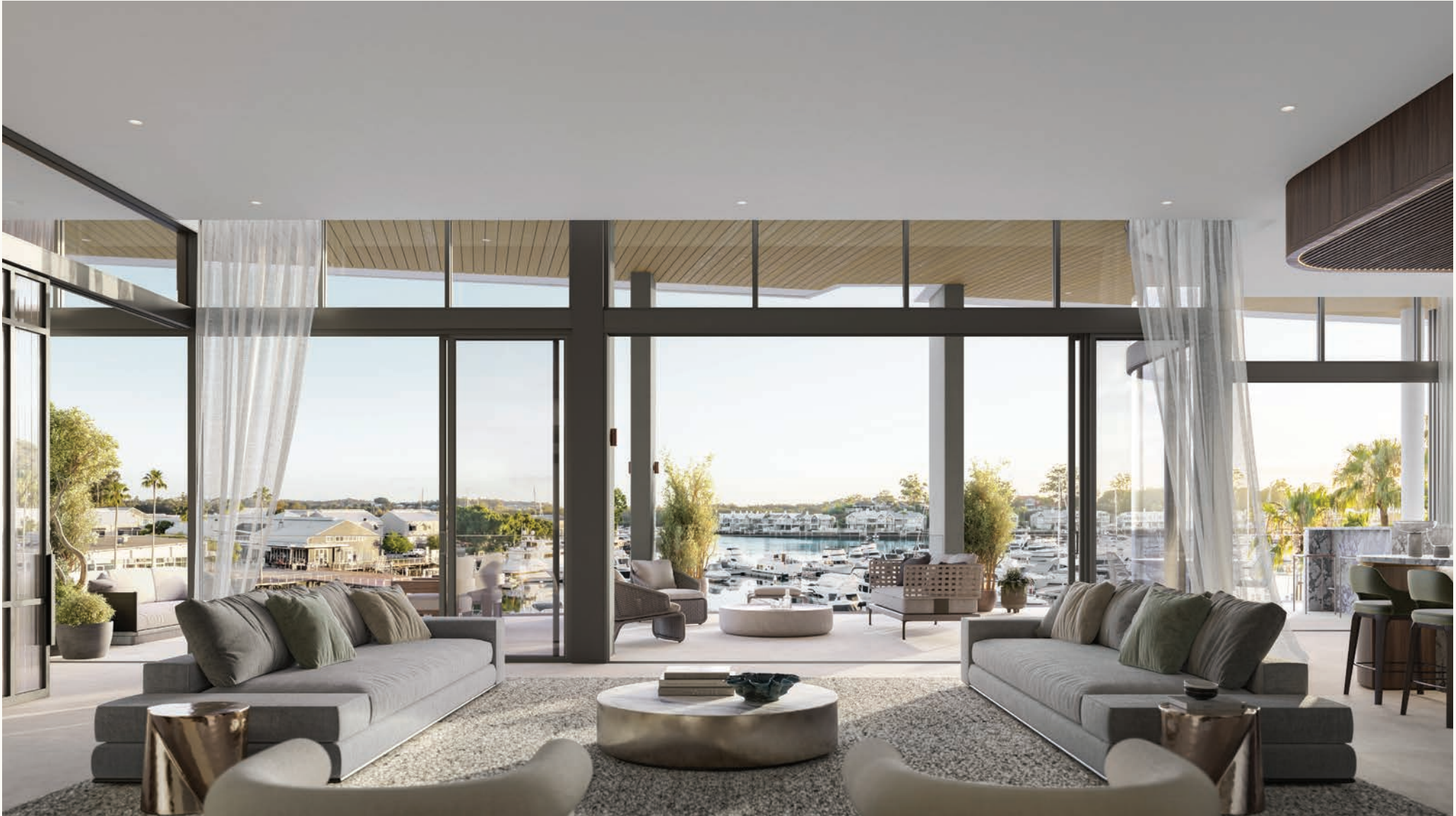
Artist impression. Indicative only and subject to change.