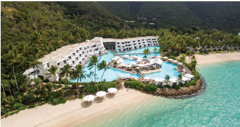
INTERCONTINENTAL RESORT HAYMAN ISLAND