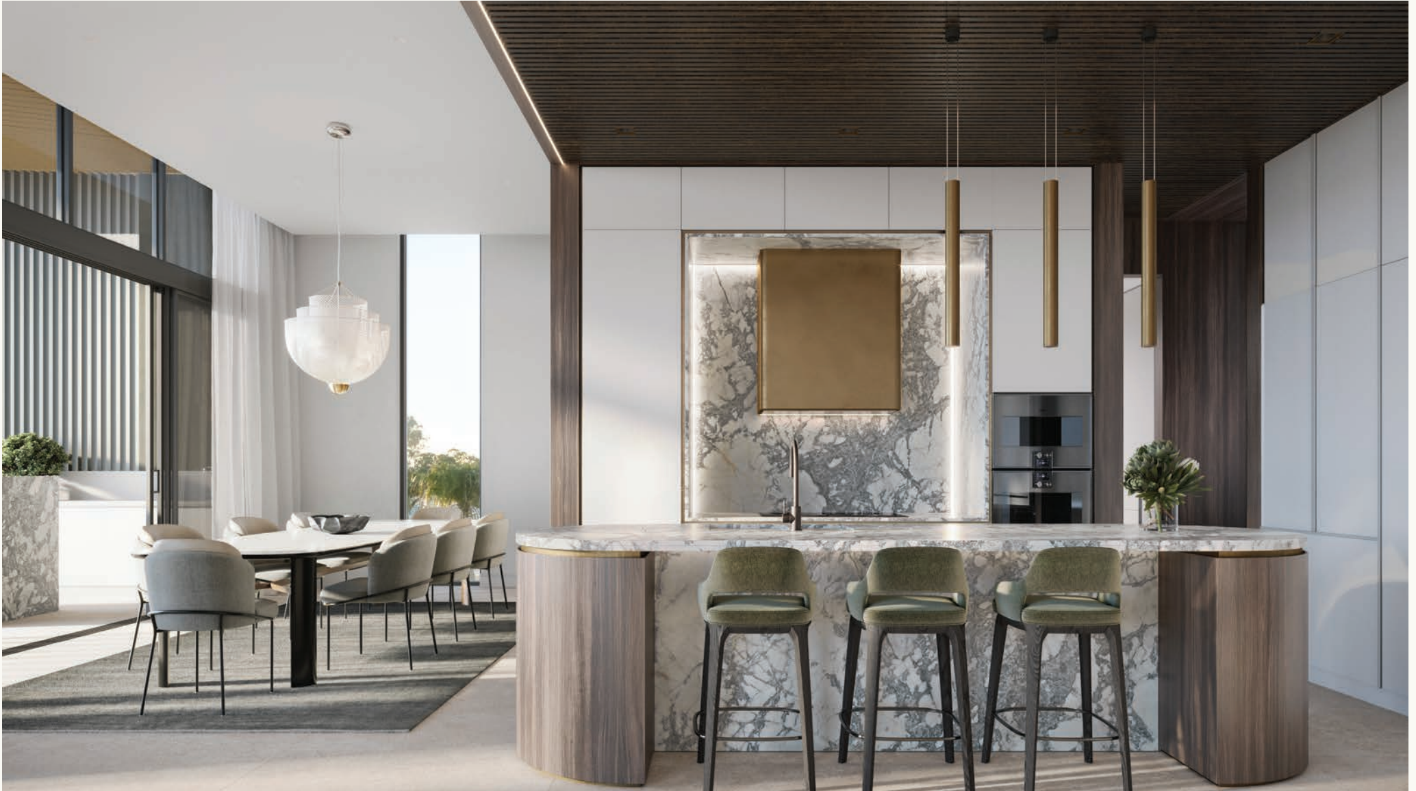
Artist impression. Indicative only and subject to change.