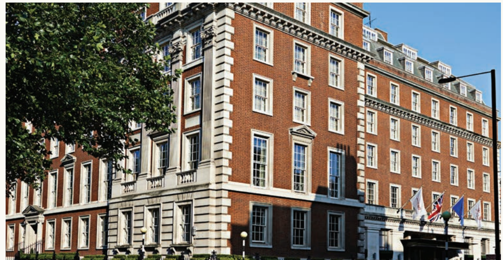
LONDON MARRIOTT HOTEL GROSVENOR SQUARE