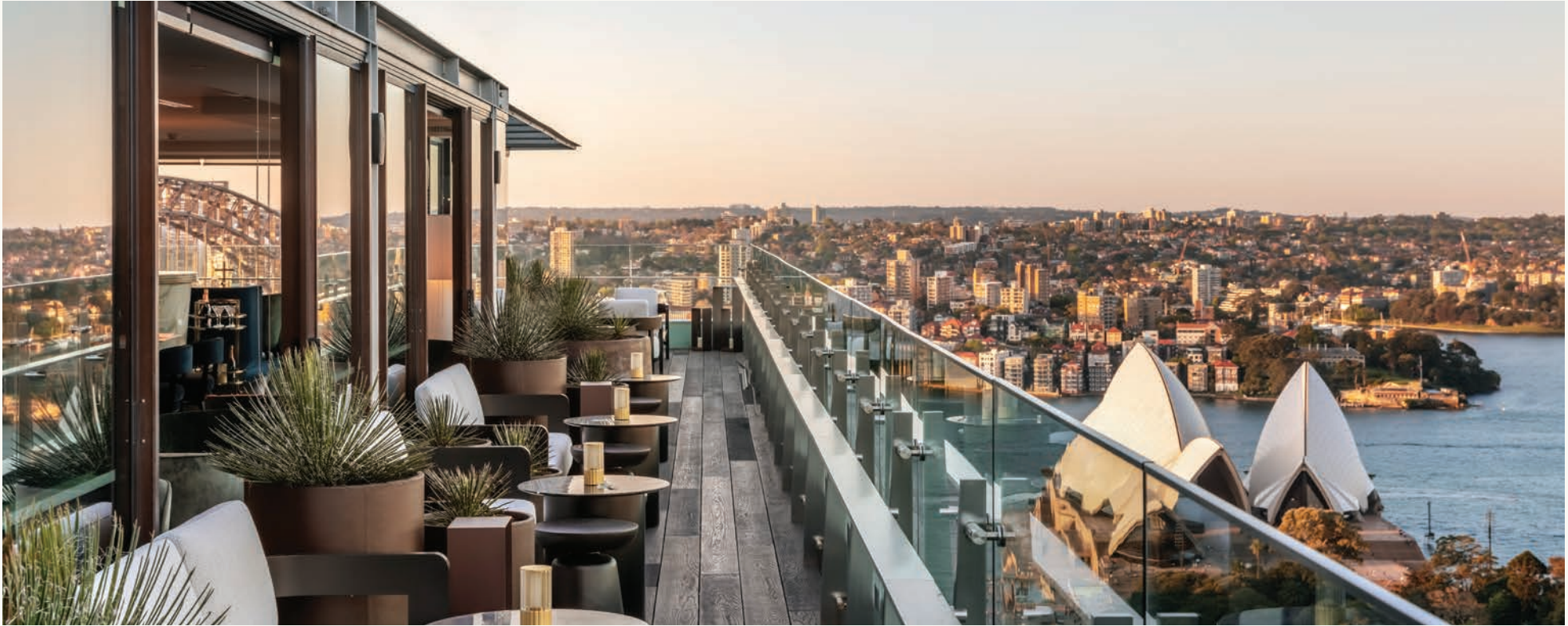
INTERCONTINENTAL HOTEL SYDNEY