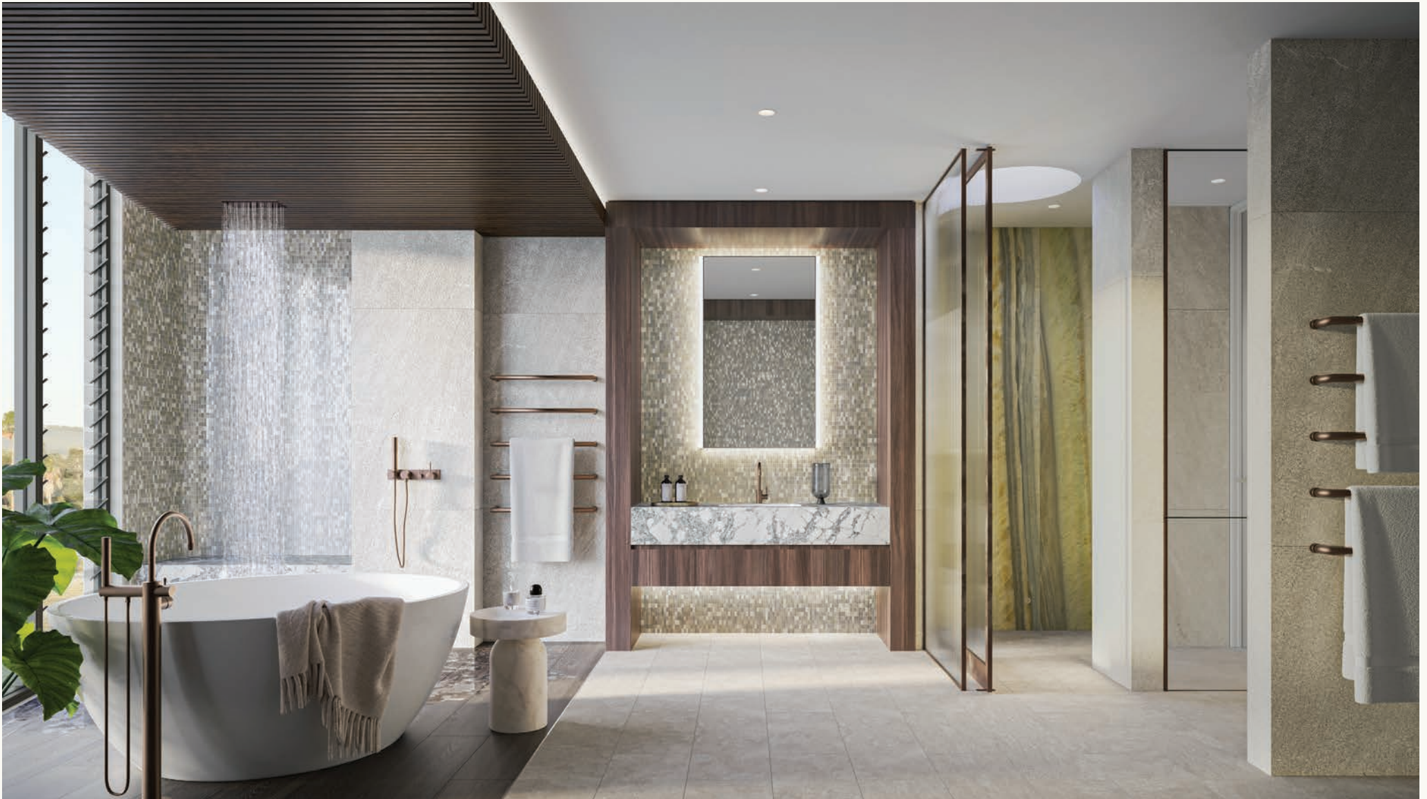
Artist impression. Indicative only and subject to change.