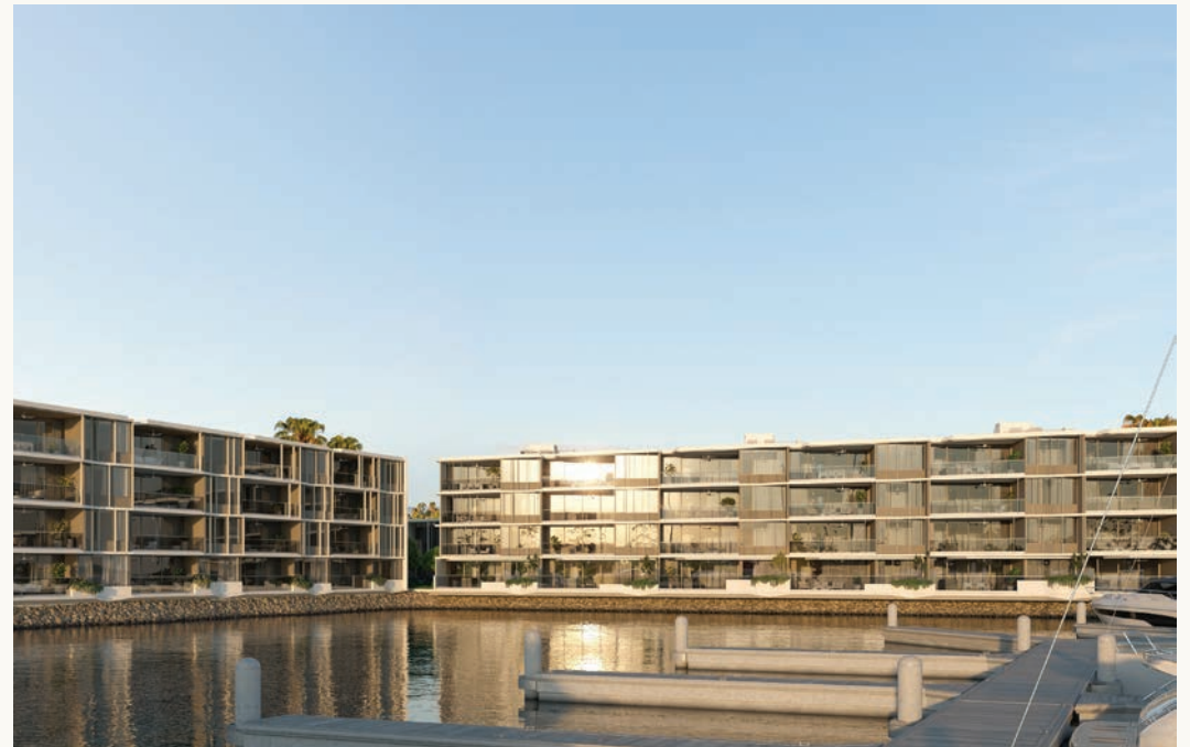
Artist impression. Indicative only and subject to change.